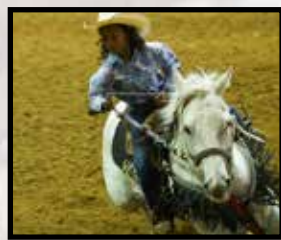
Photos taken at Memphis TN Rodeo 2018