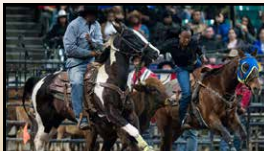
Photos MLK Rodeo Denver 2018